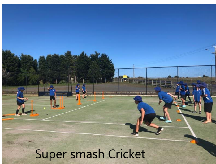
Super smash Cricket

We did heaps of sport. There was netball, Super Smash Cricket, Hockey Big Day out, Swimming Sports and now we have been training for the triathlon.